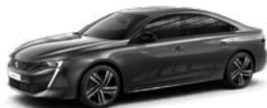
PLATINUM GREY 1