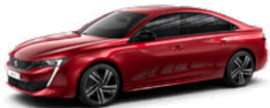
ELIXIR RED 1