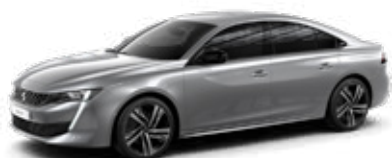
HURRICANE GREY 1