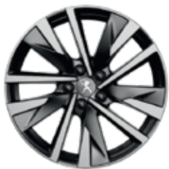
18" Sperone Two tone finish diamond cut alloy wheels (Standard on GT PHEV)

Note: Paint colours are representative only and subject to variation due to the printing process. 1. Optional extra