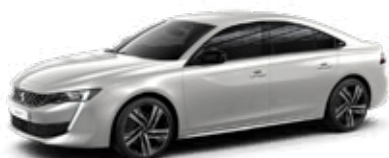
PEARLESCENT WHITE 1