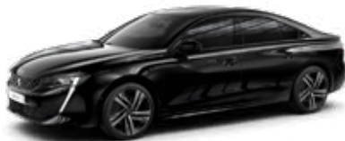
NERA BLACK 1