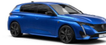
VERTIGO BLUE 1