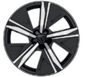
18" 'Kamakura' black diamond cut two tone alloy wheels (Standard on GT Hatch)