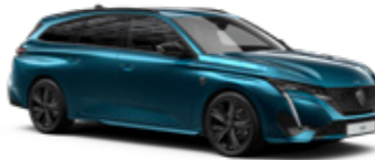
AVATAR BLUE 2