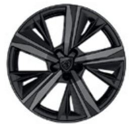
18" 'Portland' black diamond cut two tone alloy wheels (Standard on GT Premium Hatch & Wagon)

Note: Paint colours are representative only and subject to variation due to the printing process. 1. Colour only available on 308 Hatch variants. 2. Colour only available on 308 Wagon.