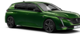
OLIVINE GREEN 1