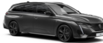
PLATINUM GREY 2